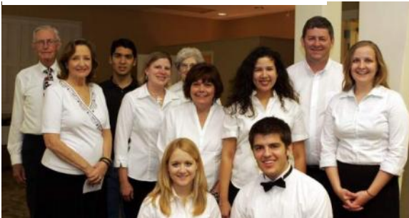
Volunteer Waiters Members of Wayside Chapel